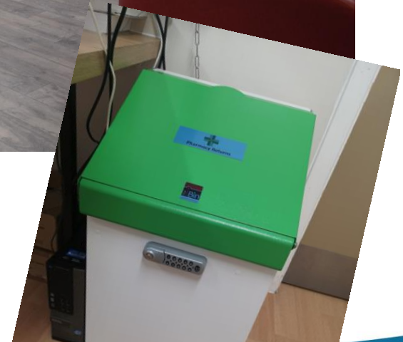
Improvements to medication disposal, labelling and the management of controlled drugs