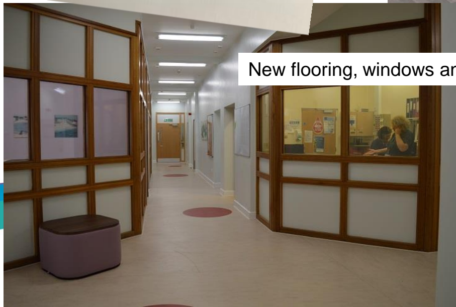
New flooring, windows and lighting